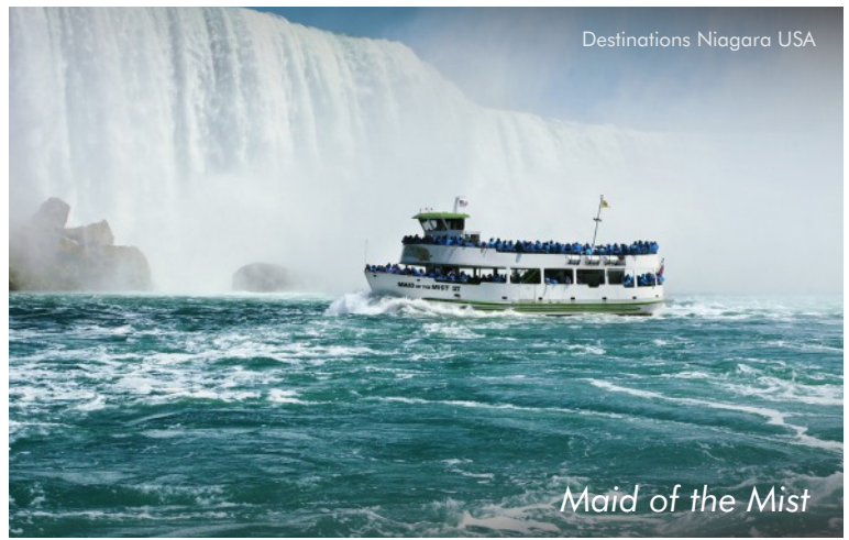
Destinations Niagara USA